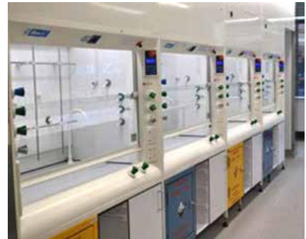
EcoAir® laboratory fume cupboard.

Shown on the right is one of many EcoAir® fume cupboards going into in a new building. This one has the available split sash. Also fitted with an optional EcoSash®, this fume cupboard's Motion Sensor panel is visible above the sash.