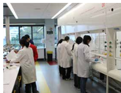
EcoAir® laboratory fume cupboard.