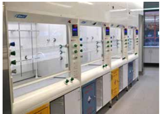
EcoAir® laboratory fume cupboard.

If the sash is opened above normal working height – 730mm is maximum – airflow at the sash will be reduced to an unsafe level. Labrocare® fume cupboards provide a lock at normal working height. It serves as a barrier that must be disabled by the operator to raise the sash above 500mm; it automatically relocks when the sash is lowered.